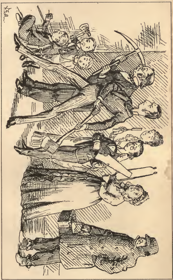
The Peterkins snowed up.